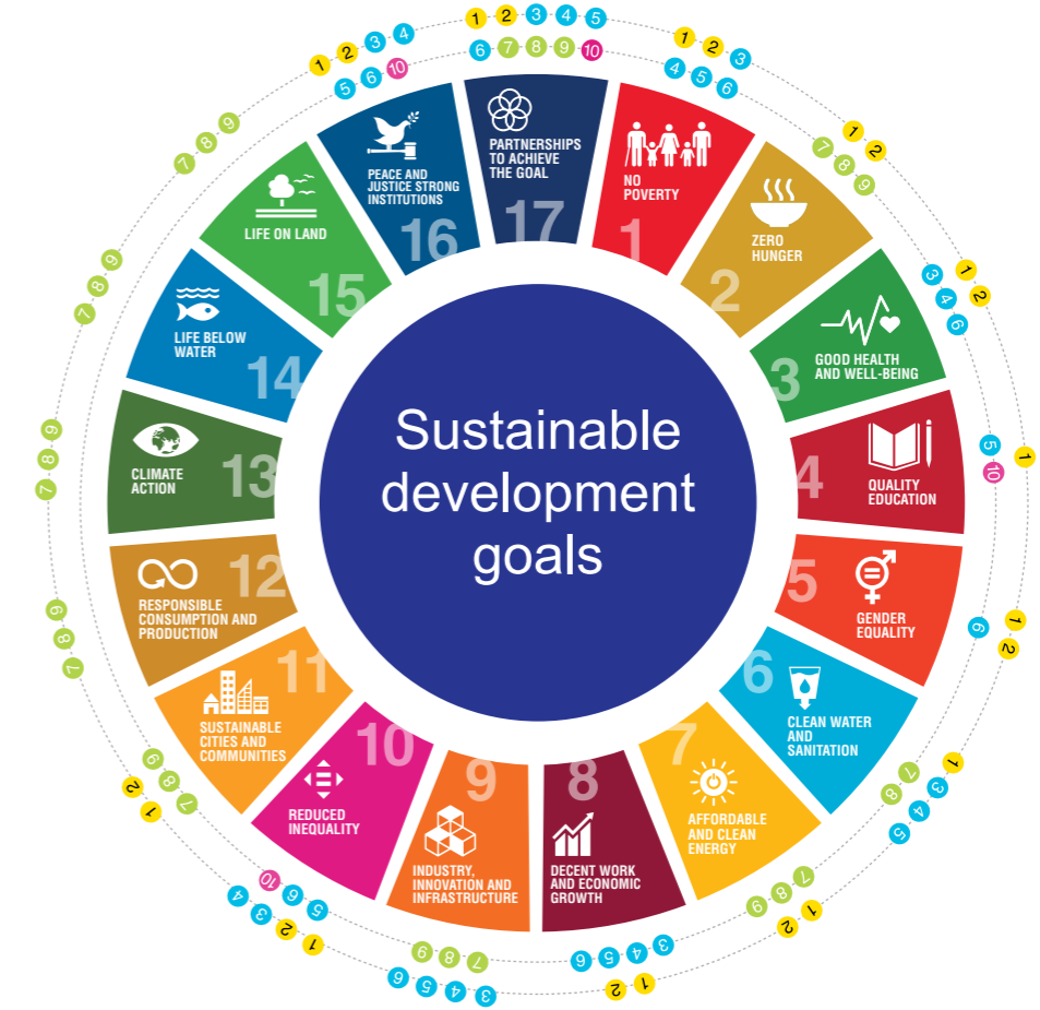
Relationship between the 17 Sustainable Development Goals (SDGs) and the 10 principles of the Global Compact (UN)

In order to implement the company's sustainability policy and apply it to all our activities, IDOM has decided to build on a number of globally recognized international standards: the principles of the Global Compact, the Sustainable Development Goals of the United Nations, the Paris Agreement, and the Glasgow Pact. By adopting these, we wish to demonstrate and underscore our commitment to human rights, labor standards, the environment, the fight against climate change and the fight against corruption. Within the framework of these initiatives, IDOM defines, in its corporate and professional activities, the objectives and goals that it can influence, and carries out the actions and operations that contribute to their achievement at local, national and global levels.